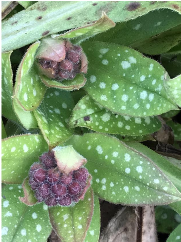
Lungwort in bud