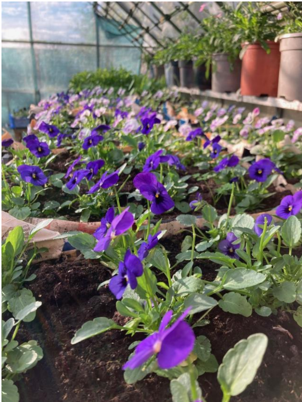
Violas loving life in the greenhouse