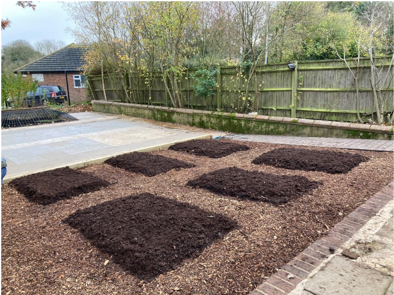
New no-dig veg patch at St John's School. Each year group has its own bed to grow veg and flowers for the coming year