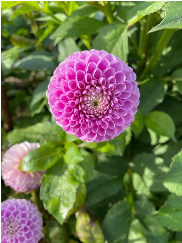
Some of their favourite Dahlias from 2022