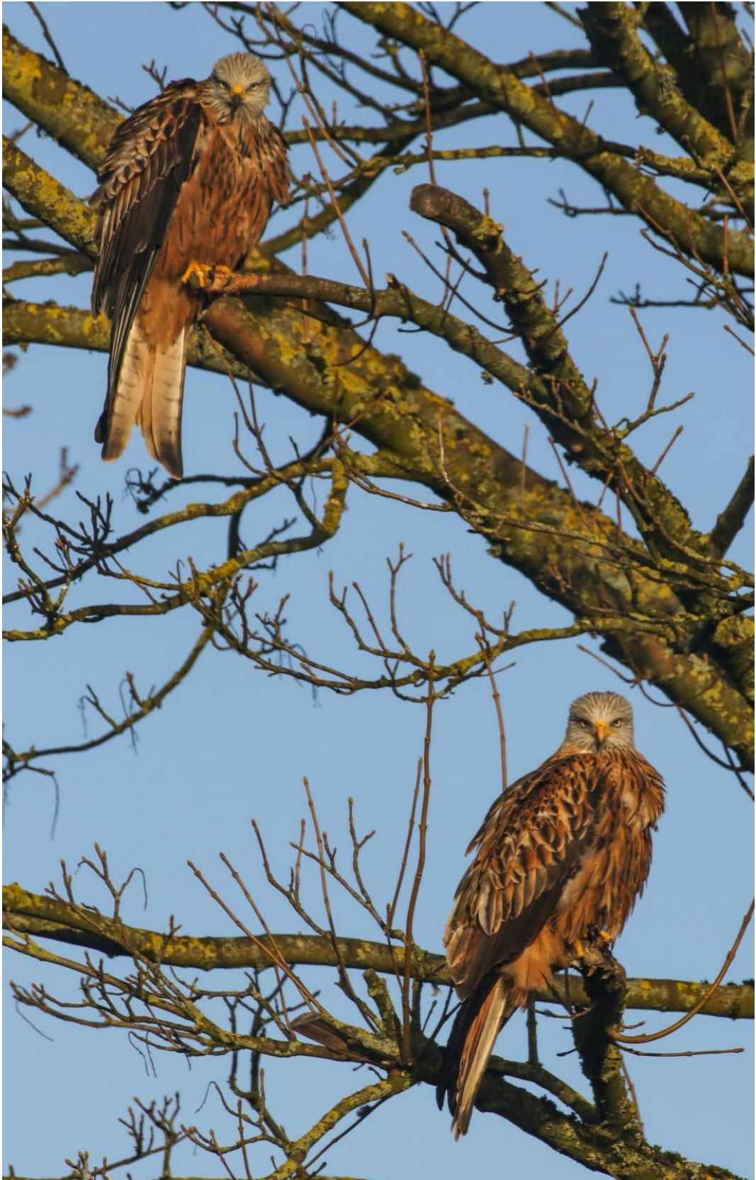
Red Kites in the neighbour's garden

Remember please keep sending in your photos they can be anything horticultural or wildlife based through to the environment and life in the Chilterns horticultural.society@btconnect.com